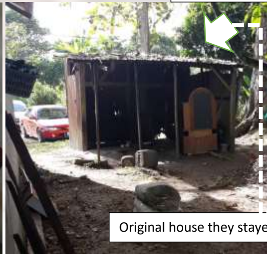
Original house they stayed for 15 + years