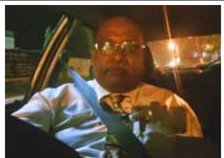
Amigo visiting on 8 Jan 2019